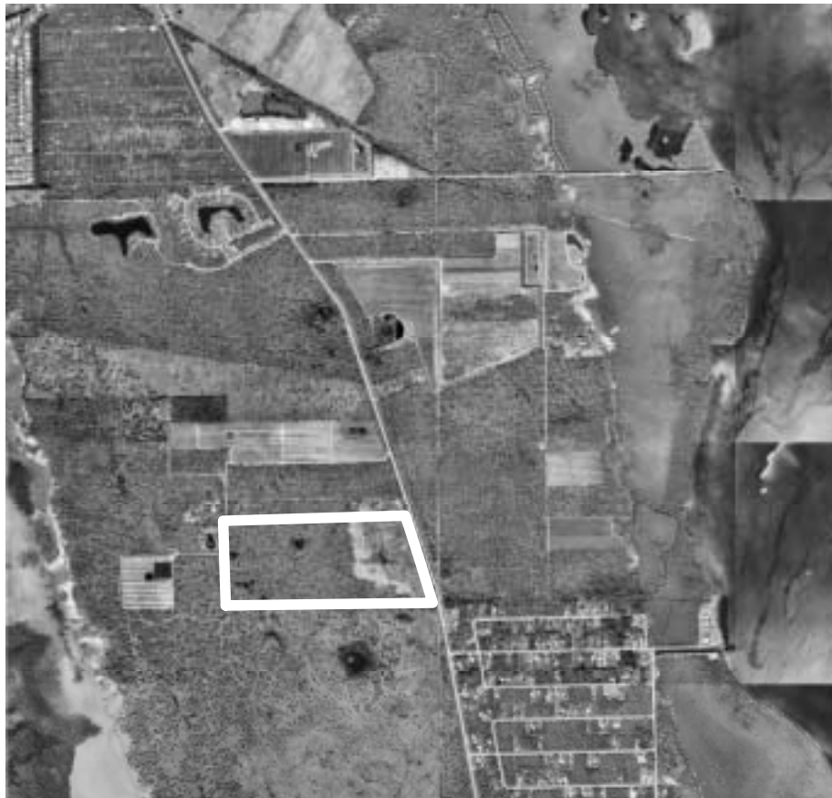
New upland preserve outlined in white; Tropical Homesites in lower right corner on east side of Stringfellow Road

This purchase constitutes a successful conclusion of a portion of acquisition priority #5 on the "CLT Wish List" (see Pages 22-4 and Appendix 6, page 1, of the February 2001 Edition of the Nature Lover's Guide to Pine Island for further details). The Miller property to the north (south of the old Bounty Road) and the Kelly property to the south (across from Tropical Homesites) constitute the remaining portions of acquisition priority #5, and are being very actively pursued.